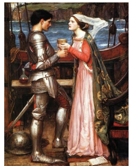
Tristan and Isolde with the Potion

A Fallen God promises to captivate readers with its rich tapestry of historical intricacy, vivid characters, and an adrenaline-fueled rollercoaster through passion and revolution.